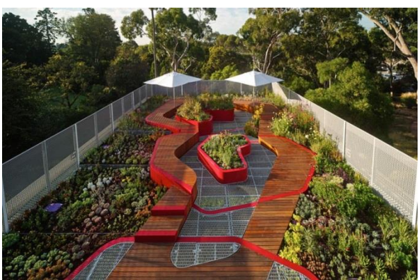
Figure 5. HASSELL Unveils Living Roofs at the University of Melbourne's Burnley Campus (Url 2).

A "green roof" is a roof of a building that is partially or completely covered with vegetation and soil. Green roofs provide energy savings (insulation for both heating and cooling), water runoff reduction, increased roof lifespan, aesthetic improvements, and other environmental benefits (Pouya & Demirel, 2017). Examples of successful green roof projects include Carleton College (MN) and Massachusetts College of Art (Figure 4). It is o the first green roof project to use only plant species native to the state. The project included the installation of the roofing systems, irrigation, plants and about 30,000 pounds of soil (Deval L. Patrick et al, 2008).