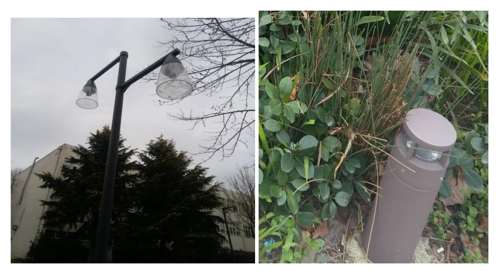
Figure 16. LED Light Bulbs In ITU Campus