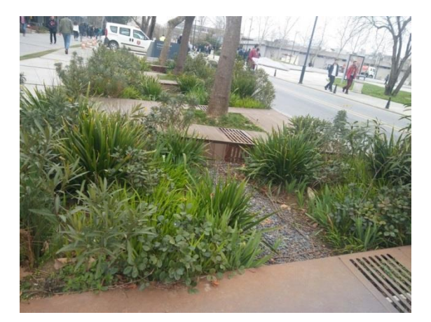
Figure 3. Examples of Rain water in the Universities' Campus