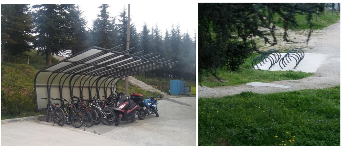
Figure 1. Bicycle usage program in Istanbul Technical University

Universities can have significant impacts on the environment because of their huge consumption of energy and materials. In the recent years, the universities have been considered as a role model of environmental responsibility. Over the last decades, the leading universities could perform significant sustainability projects in which sustainable landscaping of the campuses seems more effective. Istanbul Technical University (ITU) could also implement a list of renovations and green activities including rainwater harvesting (rain garden); bicycle usage program; forestry, irrigation system management, sustainable lighting, waste recycling, and green pesticide over its main green campus (Figure 1).