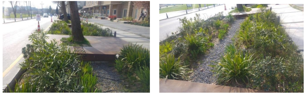
Figure 15. The Rain garden in front of the Selfish Café in Maslak, ITU

Some plants in the campus have a high water-holding capacity. These are the plants used in the rain gardens. Another feature of these plants is that they can absorb Carbon. The asphalt water is filtered by these plants and the water enters the canal and finally discharge into Gölete Lake in the ITU (Figure 15).