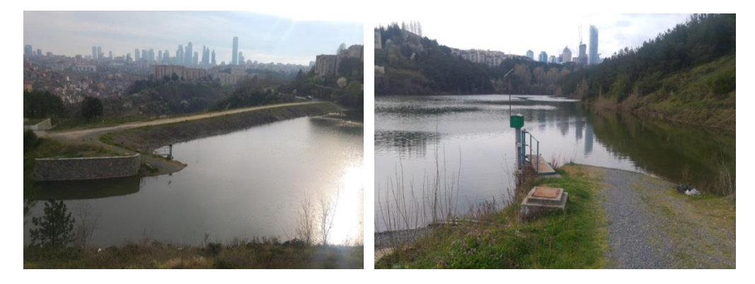
Figure 18. Golet In The North Part Of The Maslak Campus, ITU

Gölet located at Maslak Campus, the pond is fed from the rainwater collection project. No trees are used for the watering of the trees and the vegetation cover, the pool is saved and the water is being used. Biofilter method is used to keep the rainwater and accumulates in the pond (Figure 18).