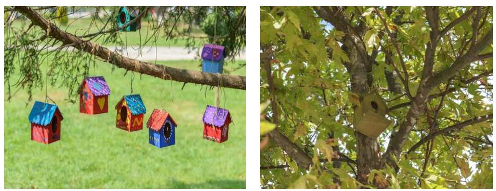
Figure 19. Bird Nests Were Placed All Over The Campus.