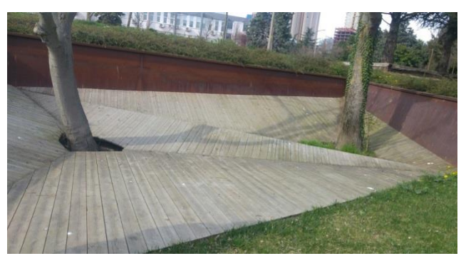
Figure 13. The Material Used In This Structure Was Not Colored. So, Over The Time, The Corten Is Washed Up Into The Soil And Afford The Necessary Fertilization Of The Soil.

Corten is the rusted steel and this rusted metal has some positive landscape effect. In fact, plants need it specially, as it is typical chemical fertilizers. In this context, it is beneficial for the lawn and plants where the Corten is mixed with soil in the rainy weather and support for the growth of the plant (Figure 13& 14).