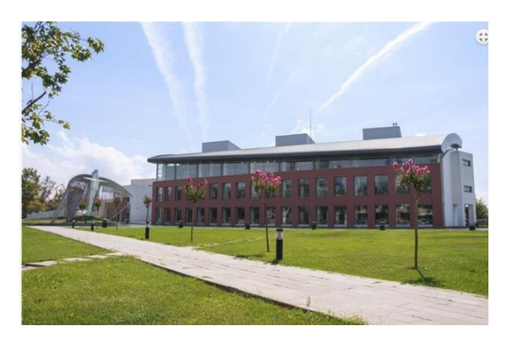
Figure 11. The road across the library was paved and warmed up in the summer. The rainwater there was not able to mix with the soil in this part before. With the infrastructure and landscaping in this region, the area has become a more livable area.

Figure 10. Maslak Campus is planned to be a total of 6 kilometers of the planned cycle and pedestrian way.