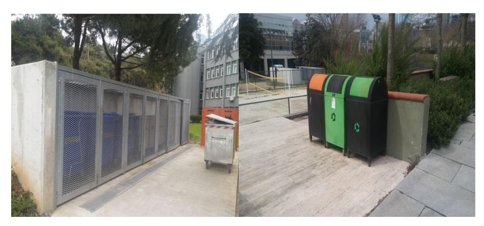
Figure 17. Recycling Boxes In ITU Campus

Efforts are being made to develop a nature-friendly system for decomposing and recycling chemical wastes, especially in laboratory work. For this purpose "Waste Management Commission" was established. For the recycling of daily wastes, recycling boxes for paper, plastic, and glass waste were installed on the Ayazağa Campus (Figure 17).