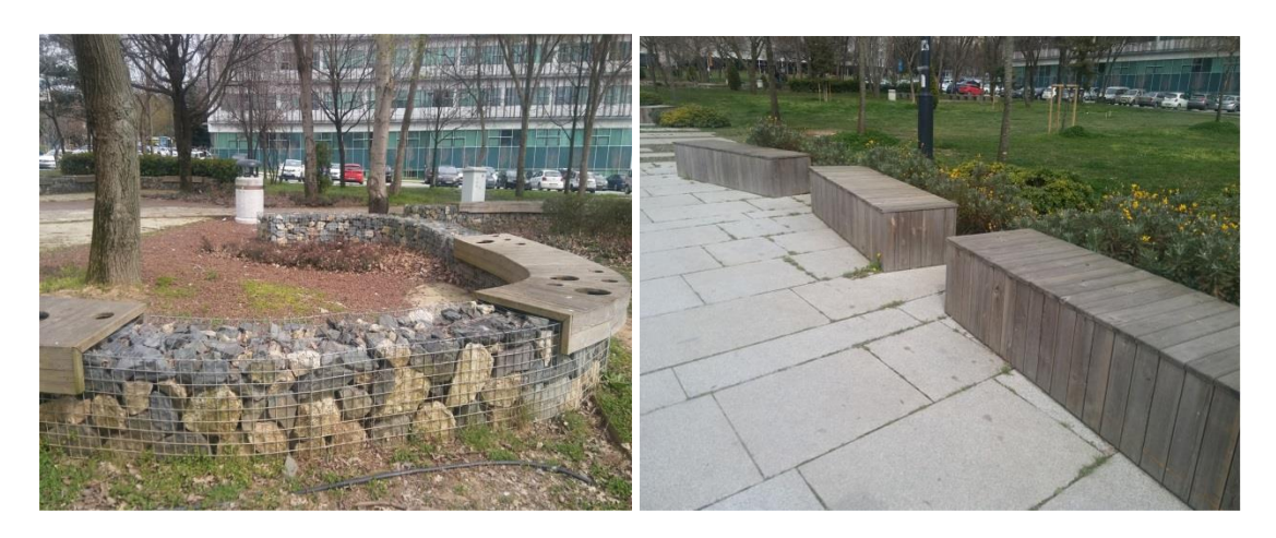
Figure 14. The Seating Bands Are Made Of Natural Materials In ITU Campus