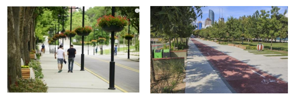
Figure 10. Maslak Campus is planned to be a total of 6 kilometers of the planned cycle and pedestrian way.