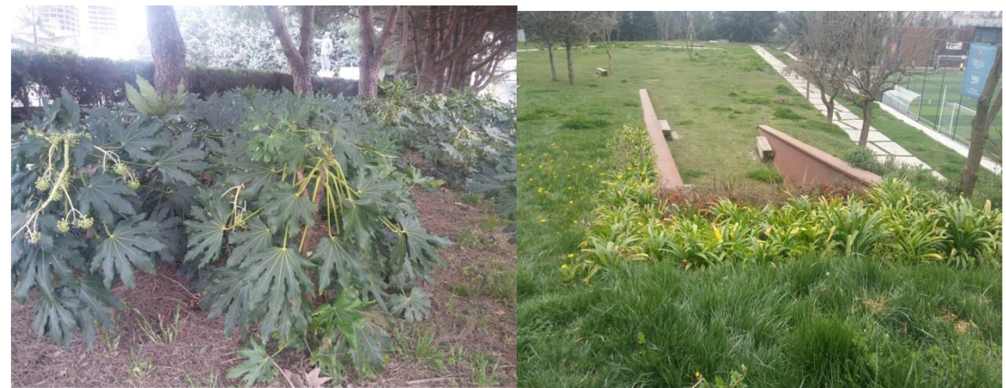
Figure 12. Native plant selection in ITU Campus