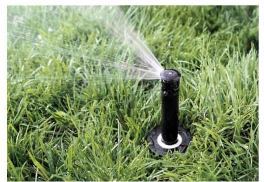
Figure 2. A Rainbird sprinkler.

Facilities Services staff of UC Berkely have continued to research new technologies that make irrigation "smarter", which automates irrigation management. Irrigation management will be further improved by a "weather station" that will provide the irrigation system realtime or predicted weather information so that grounds are not over watered (UC Berkely, 2008). Butler University utilizes sprinkler shut-off valves combined with timers. These sprinklers include quick shutoff valves and programmable timers that allow the University to closely regulate water use (Figure 2). These two features, in conjunction with careful monitoring and checking of soil conditions by grounds crews, are effective in conserving water used for campus irrigation needs (Indiana Wild Life Federation, 2014).