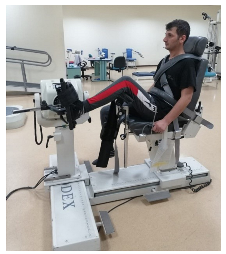
Figure 1. Isokinetic strength tests of the knee and ankle muscles

Isokinetic strength tests of the knee and ankle muscles were conducted by using Biodex System-3 (BS-3, Biodex Medical Systems, Shirley, 2000, New York). Before the isokinetic tests, a 10-minute long warm-up was performed with Fitron (Lumex Corp., Ronkonkoma, NY) lower extremity bike. For strength measurement, the subject was made to sit and then fixed by using the leg, femoral, pelvic, and upper body diagonal stabilization straps according to Standard Biodex procedure. Before the measurement, the patient watched the demo video of the test, and the exercise phase was performed with the three repetitions. The test was performed after a 15-minute rest following the exercise phase. Knee extension (0°) and flexion (100°) and ankle dorsiflexion (15°) and plantarflexion (15°) muscles strengths were assessed by using concentric/concentric mode at 90°/sec angular speed. The test procedure was conducted according to the manufacturer's guideline (7). The parameters of the peak torque (Newton meter-Nm), the average power (Watt), the total work (Joule), and H/Q peak torque ratios were analyzed from the automatic printout taken from the device (Figure 1).