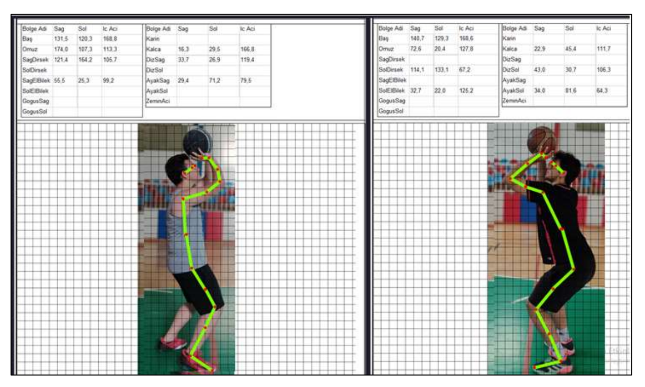
Figure 2. Analysis of the Joint Angles of the Groups with High Shooting Rate (Right Photo) and Low Shooting Rate (Left Photo) Groups Participating in Infrastructure Basketball Training in the Shooting Starting Phase Position.