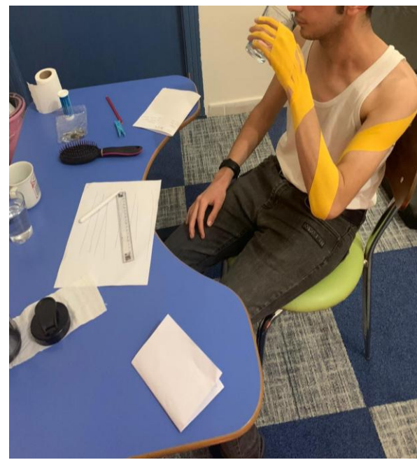
Figure 2. Frenchay Arm Test application with Kinesio taping.

Kinesio taping was applied to the study group to improve posture and improve function in the shoulder area. Measurements were carried out for the study group before and after application (with tape on). The tape was then removed and the measurements were repeated after 1 week. Before applying the tape, it was checked whether the children were allergic. Tape was first started from the distal part of the fingers and taped with 0% tension with Kinesio Taping Functional Correction Technique. Another I tape was applied from palmar area of the hand to spina scapula for supination of the forearm and external rotation of the shoulder with %0 tension to make functional correction (Figure 2). Kinesio Taping Functional Correction method is suggested to be done with 75% of tension but for children, we applied it with 0% tension to minimize the shear effects to the skin (Kase, 2006). Kinesio Tex Ligth Touch Plus tape was used for taping application (Kinesio Co., USA).